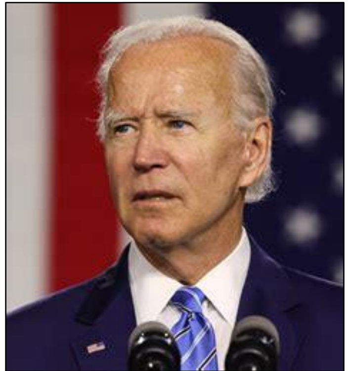
Joe Biden, (1942 –)

Want more quotes from Joe Biden? “No, thank you.”