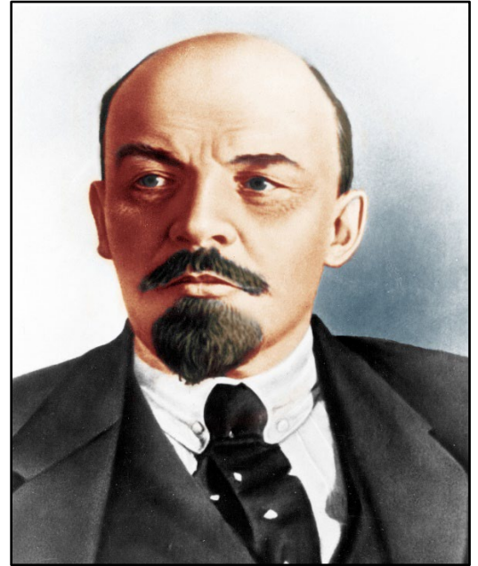
Vladimir Ilyich Lenin (1870 – 1924)

For more quotes from Vladimir Ilyich Lenin, go to https://www.azquotes.com/author/8716-Vladimir_Lenin?p=2