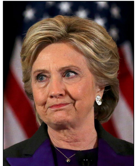
Hillary Clinton (1947 - )

For more quotes from Hillary Clinton, check any mainstream media newspaper while you are wrapping your fish with it.