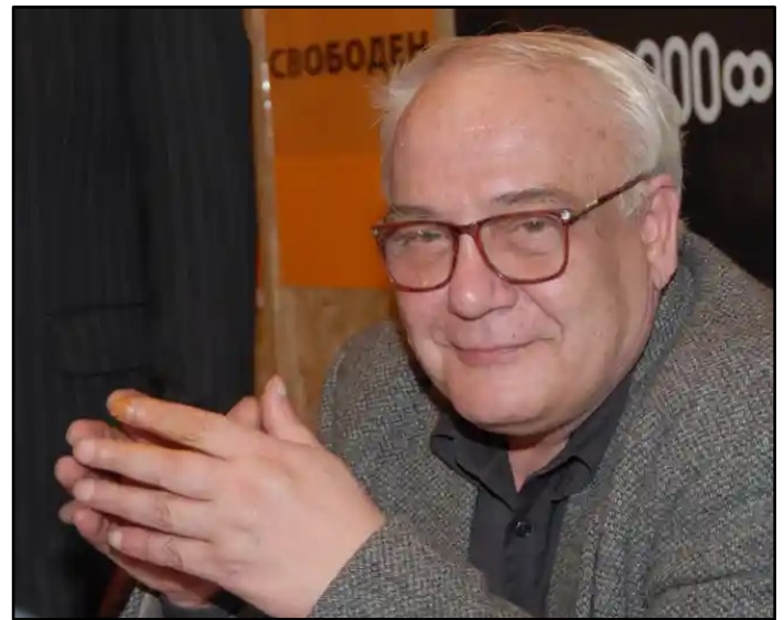
Vladimir Bukovsky; December 30, 1942 – October 27, 2019

To learn more about Vladimir Bukovsky go to https://www.theguardian.com/world/2019/oct/28/vladimir-bukovsky-obituary