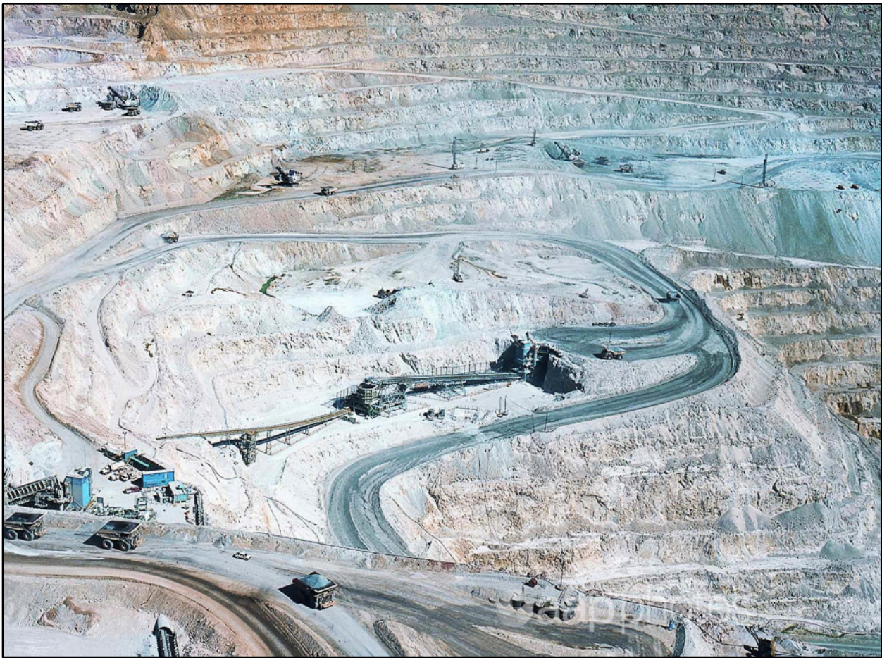
Aerial photo of a lithium mine. Large amounts of lithium are required for Electric Vehicle batteries

https://s3.ap-southeast-2.amazonaws.com/aap-nw-aap.com.au/wp-content/uploads/2021/02/11125006/3e98782a5bbe08beacd26541be827d6c6e0edff60ae510c424dd1f8818689ee1.jpg?v=1613008208