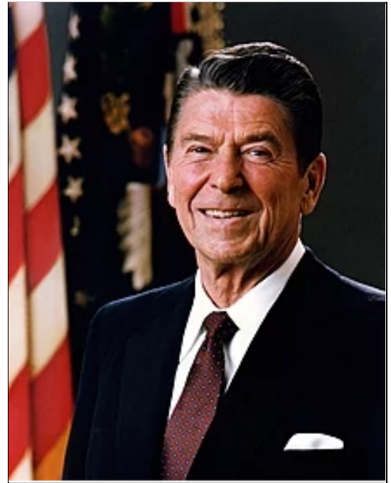
Ronald Reagan, 1911-2004

“We must reject the idea that every time a law's broken, society is guilty rather than the lawbreaker. It is time to restore the American precept that each individual is accountable for his actions.”