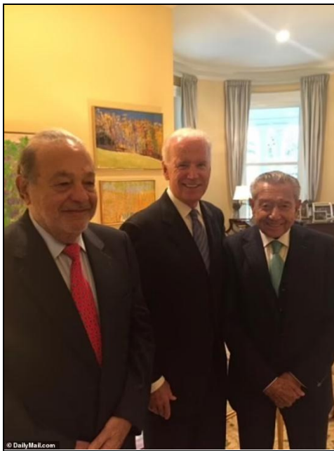
Joe Biden entertained Mexican billionaires Carlos Slim and Miguel Aleman Velasco – his son Hunter's business associates in the vice President's office in 2014

https://www.dailymail.co.uk/news/article-10938637/Voicemail-Joe-Biden-Hunter-proves-president-DID-speak-Chinese-business-dealings.html