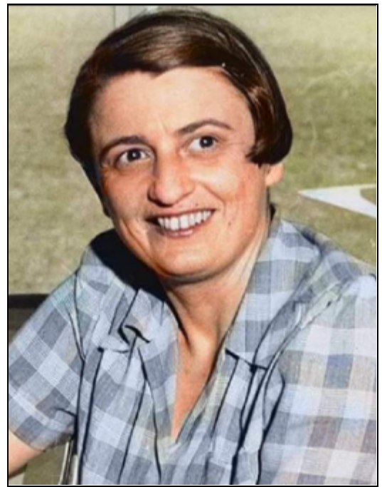
Ayn Rand, 1905 - 1982

To learn more about Ayn Rand go to https://aynrand.org/